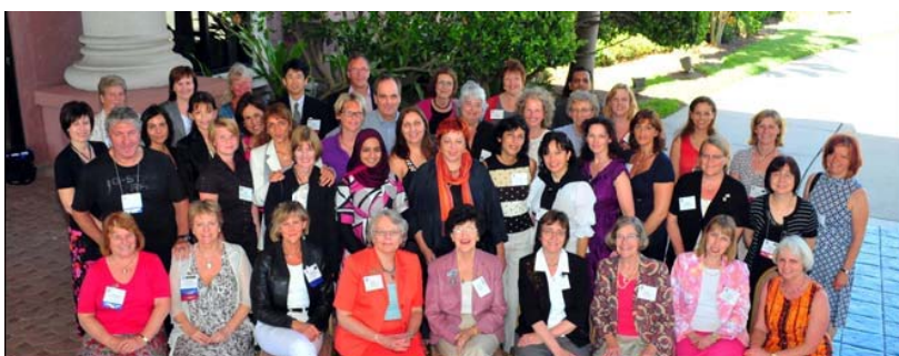
IFSHT 8th Triennial Council Meeting includes 2007-10 executive committee, 24 of 31 full member society delegates, 2 of 5 corresponding member country representatives, all 7 past-presidents, and other invited guests.

This Update presents photo highlights from our 8th Triennial Congress in June. Over 500 people from 35 countries attended this stimulating educational and fun social/cultural event. Educational events included morning general sessions and afternoon concurrent break-out, workshop, and poster sessions.