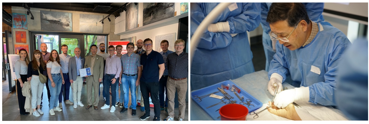
Figure 6: Course participants, Warsaw