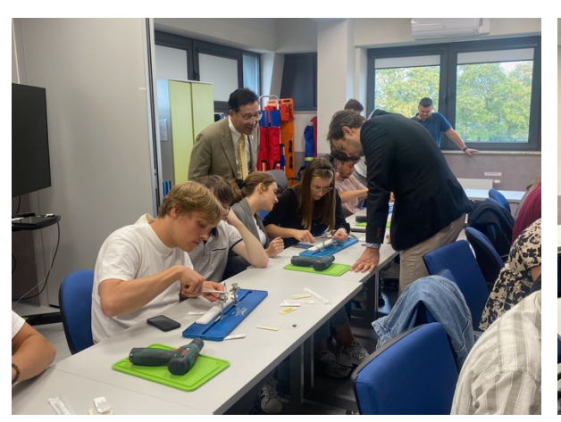
Figure 13: Anatomical model course