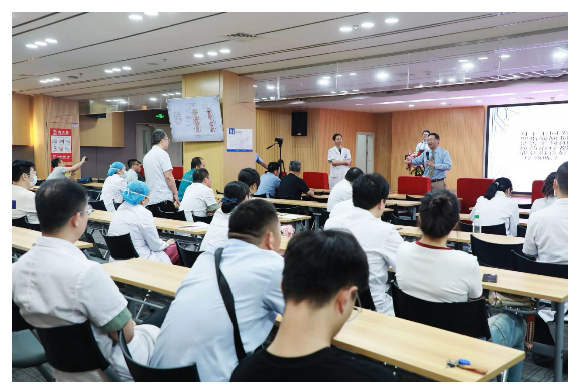
Figure 7. The faculty and local surgeons engaged in lively discussions.