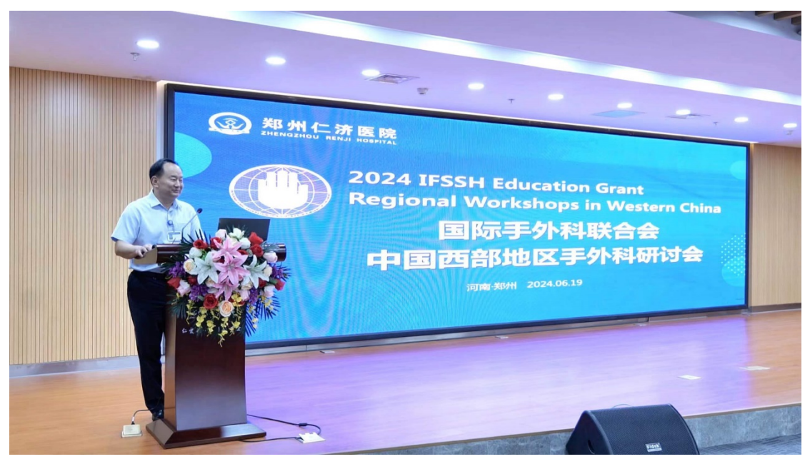
Figure 6. The host welcomed the project and shared their complicated cases they encountered in clinic. Faculty provided many suggestions and guidance.

Figure 5. Dr. Zheng shared her experience in microsurgical lymphatic surgery for the treatment of secondary lymphedema and alzheimer disease.