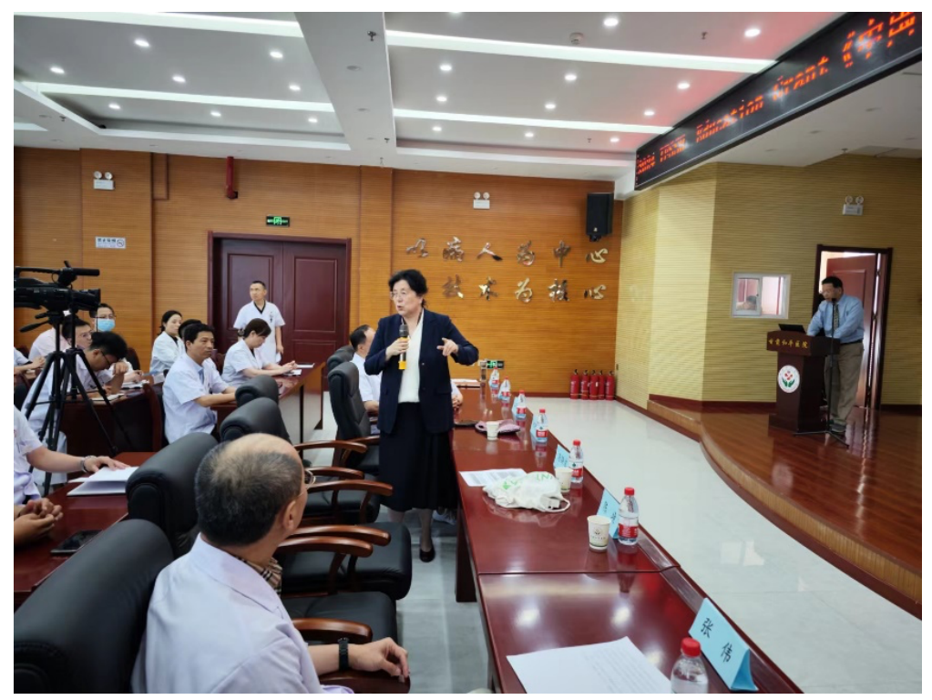
Figure 4. There was ample time for discussion after every course - surgeons raised a lot of good questions that the faculty answered one by one.