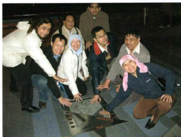
FIG. 6 Malaysian Hand surgeons and friends at the APFSSH Hong Kong (2008) posing at the hand print of Jackie Chan.