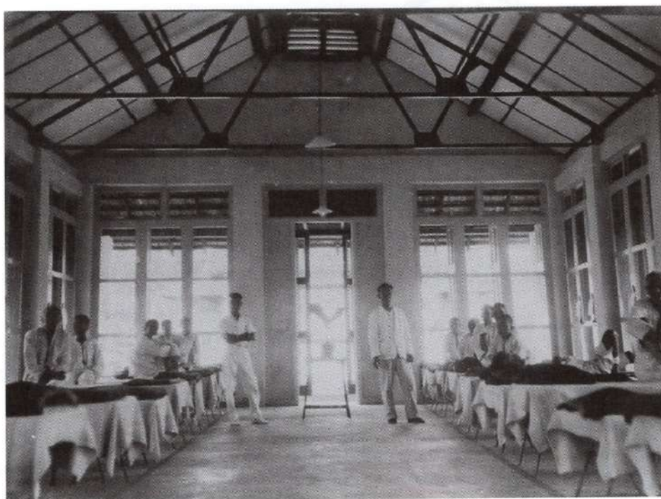
FIG. 1 Sungei Buloh Leprosarium Ward.