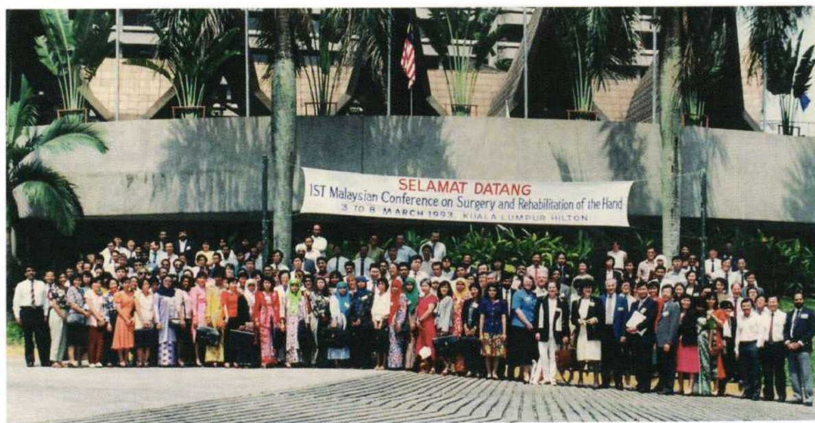
FIG. 4 1st Malaysian Conference on Surgery and Rehabilitation of the Hand – 1993.

therapists as associate members. We ran joint “Roadshows” with therapists, in most of the 14 states in Malaysia where the surgeons would talk about various topics covering hand trauma and the therapists would hold splinting and therapy workshops.