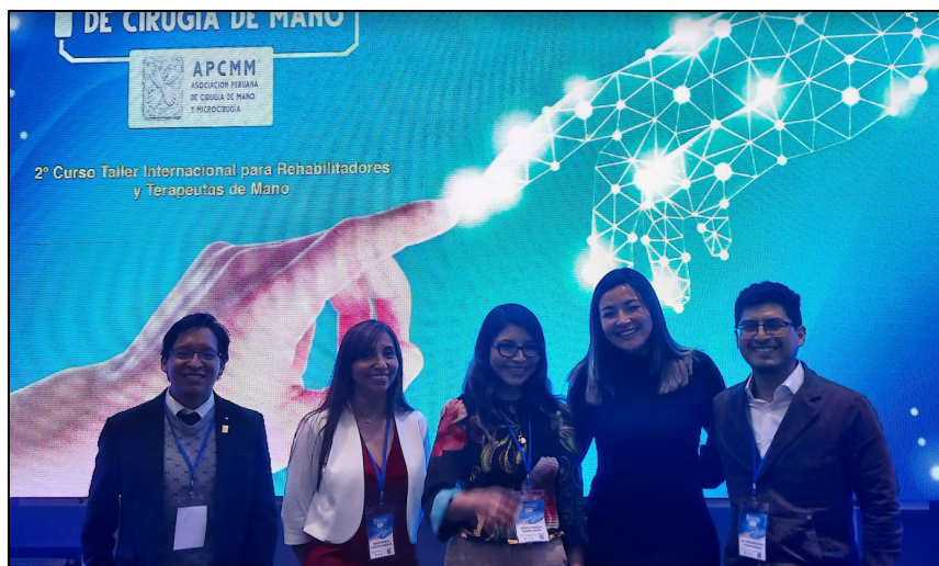
Newly Associated Young Surgeons

At the present time, our association has 32 active members, and 29 honorary members. Three elected Boards of Directors have served so far. Each one had distinct views for our young association. But all shared the common goal of guiding new generations of hand surgeons.