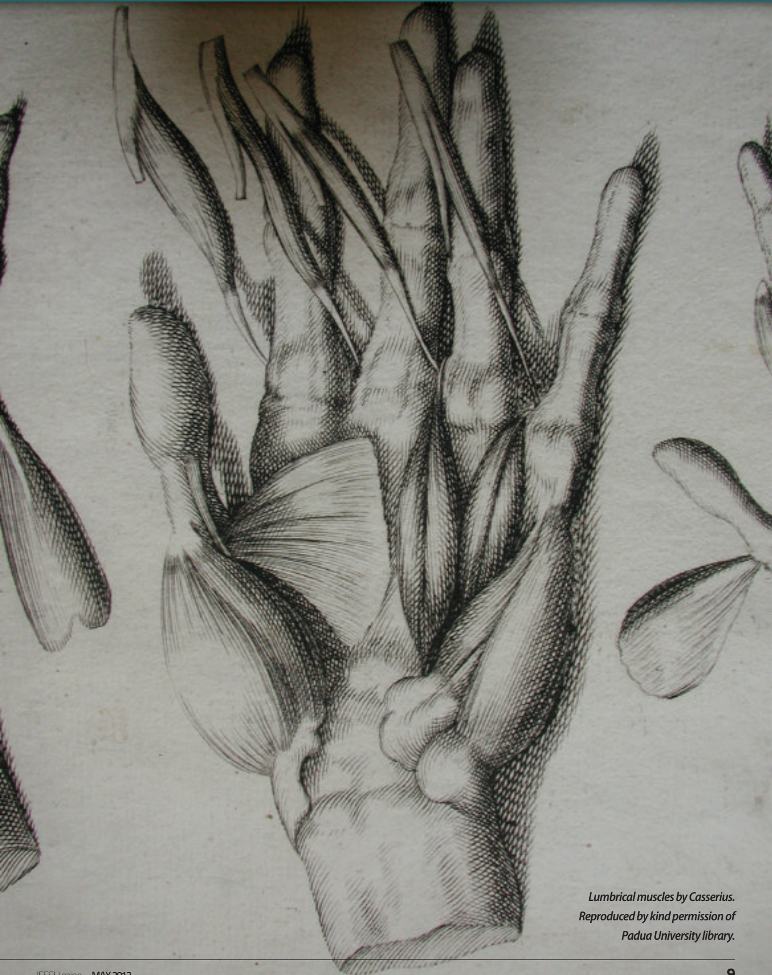
Lumbrical muscles by Casserius. Reproduced by kind permission of Padua University library.