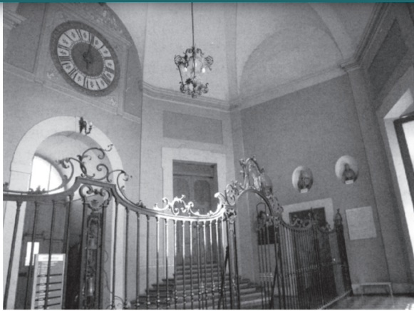
Top left: The Malagoli gate, main entrance of ex-Hospital Sant'Agostino, Modena.