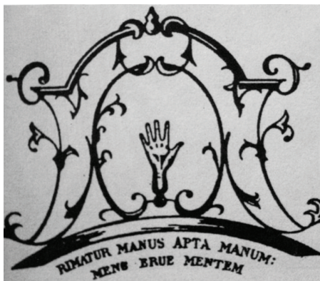
Logo of the Italian Society for Surgery of the Hand (SICM).